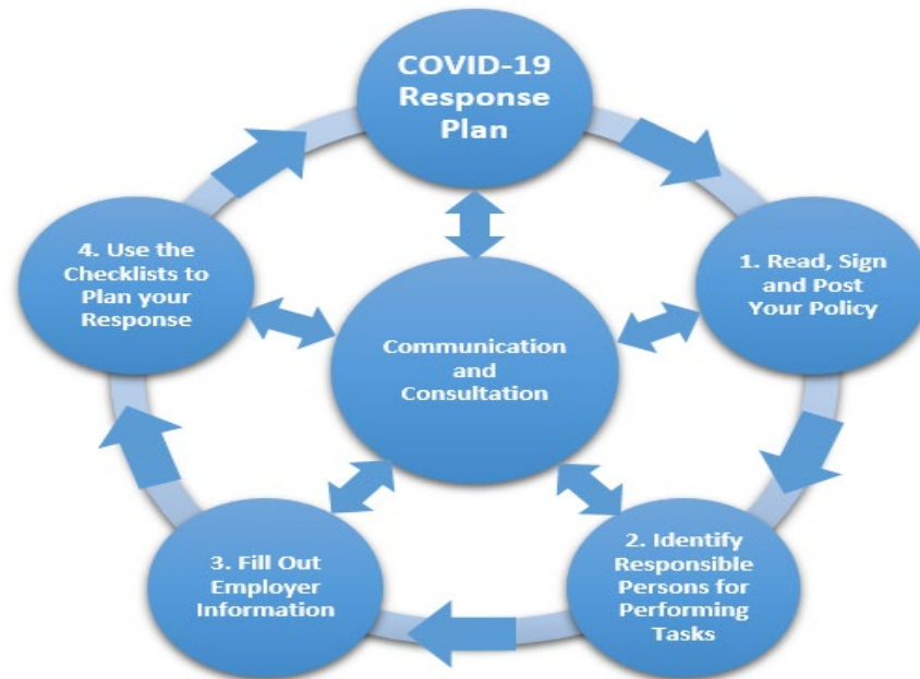
Figure 1 – COVID-19 Response Plan 4 Step Process

N.B. It is important to keep the plan under review to ensure it is kept up to date with public advice and to follow up on all actions identified on each checklist to make sure that they are completed as soon as possible.